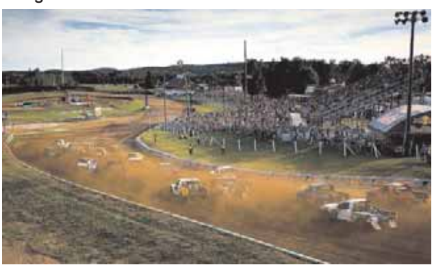
BIG HOUSE, BIG CROWD: Last year, Crandon International Raceway hosted the largest crowd in its 48 year history, with nearly 50,000 fans packing the 400-acre facility for two days of intense racing (top). Crandon's legendary 100 mile per hour Forest County Potawatomi Turn 1 (above) keeps fans coming back every Labor Day weekend.

For the second time in the sport's nearly 50-year history, short course competitors from all sanctioning bodies around the country can race on a completely level playing field with no concerns about points or season championships. Hosted and sanctioned by Crandon International Raceway, the event will once again offer the world's best professional off-road racers the sport's largest crowd, the largest television package and the largest single day purse – which last year reached a record cash and prize payout of more than $176,000. Along with cash, last year's winners of the PRO 2 and PRO 4 categories took home a brand new Polaris 1000cc RZR.