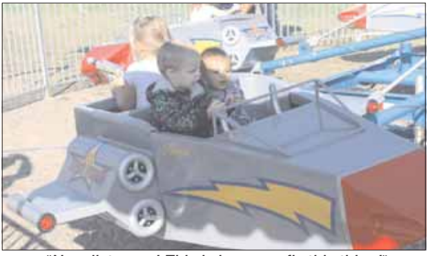
"Now listen up! This is how you fly this thing!"