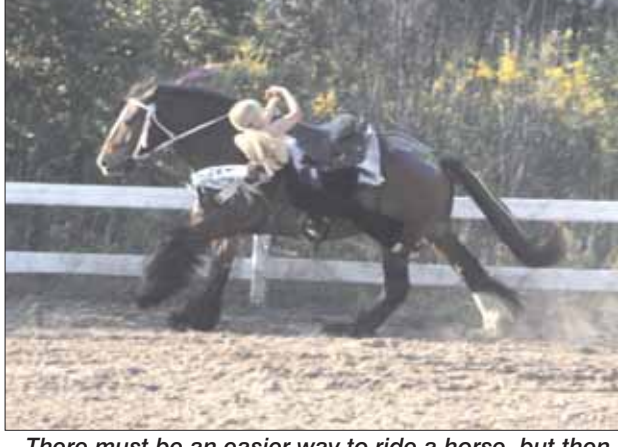
There must be an easier way to ride a horse, but then anybody could do that!