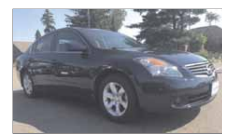
2009 Nissan Altima 2.5S Moon Roof. 92K Miles $7,565