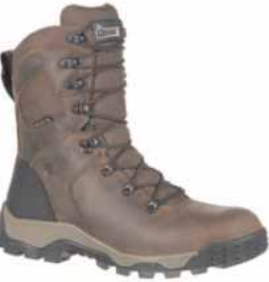
Rocky Sport Pro Waterproof, 200 grams insulation Reg. $159.99 SALE $139.99