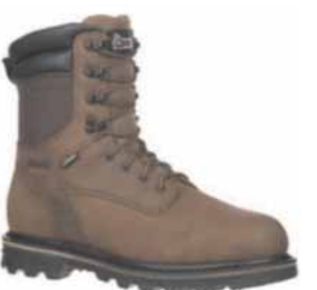
Rocky Cornstalker Waterproof, 600 grams insulation, Gore Tex Reg. $169.99 SALE $149.99