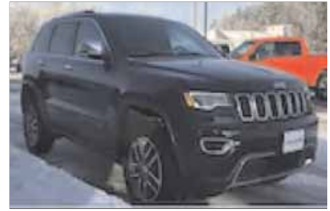
2017 Jeep Grand Cherokee LTD 20K Miles $31,132