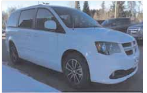
2017 Dodge Grand Caravan GT 30K Miles $20,120

2530 Neva Rd., Antigo, WI 715-627-2200 • 1-800-232-5375 www.langladeford.net Sat., 9-1