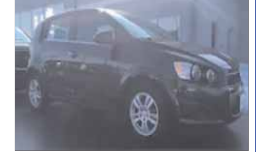
2015 Chevy Sonic LT 50K Miles $8,795