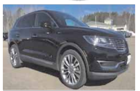
2016 Lincoln MKX Reserve 24K Miles $35,395