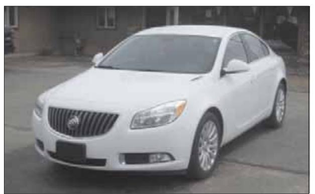
2012 Buick Regal Heated leather seats, Only 41,700 miles $10,900

www.parsonsofcrandon.com Financing Available