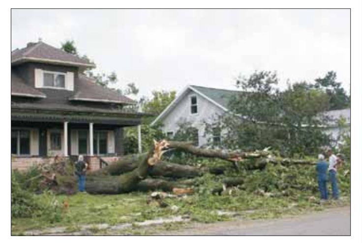
This big shade tree was along Hwy 45, and had provided shade and beauty to the street. If it could talk, it could have told you a great deal about Elcho's history!