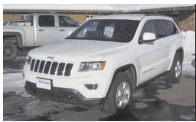
2014 Jeep Grand Cherokee Laredo Very Clean, AWD $13,900