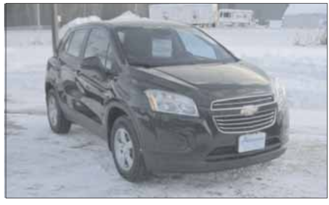
2015 Chev Trax LS $10.900