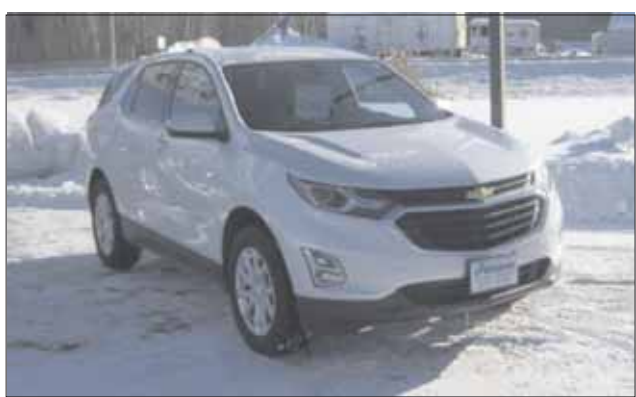
2019 Chev Equinox LT $24,900