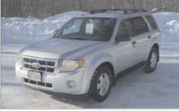
2010 Ford Escape XLT AWD $4.900