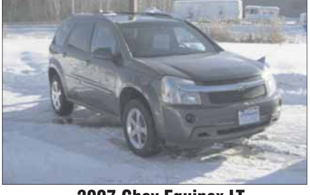
2007 Chev Equinox LT AWD $6,900

www.parsonsofcrandon.com Financing Available