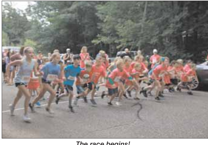
The race begins!