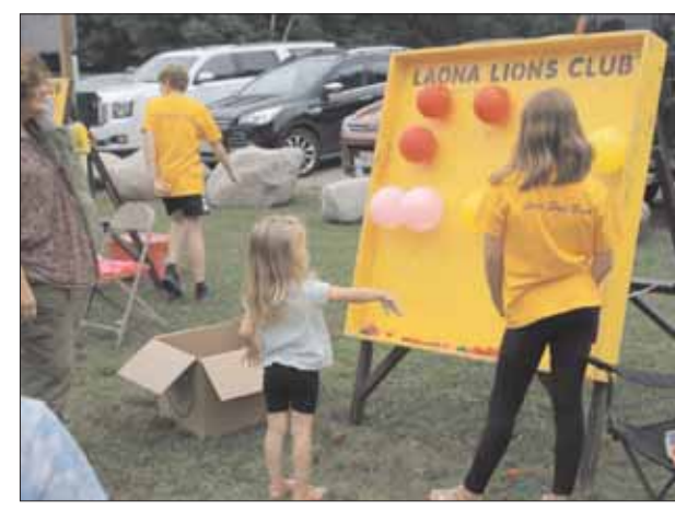
The kid's' games were enjoyed by a great many kids.