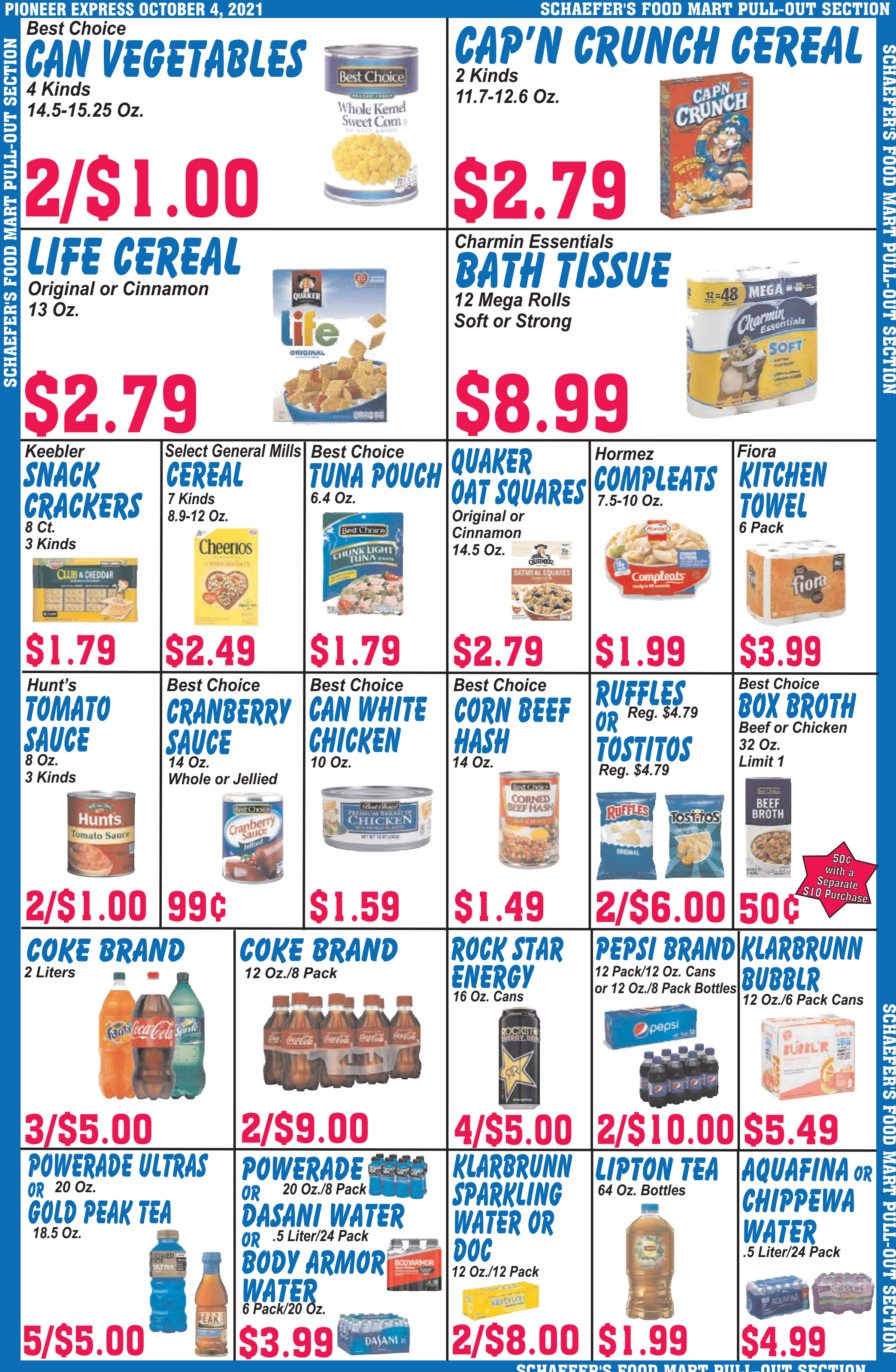
SCHAEFER'S FOOD MART PULL-OUT SECTION