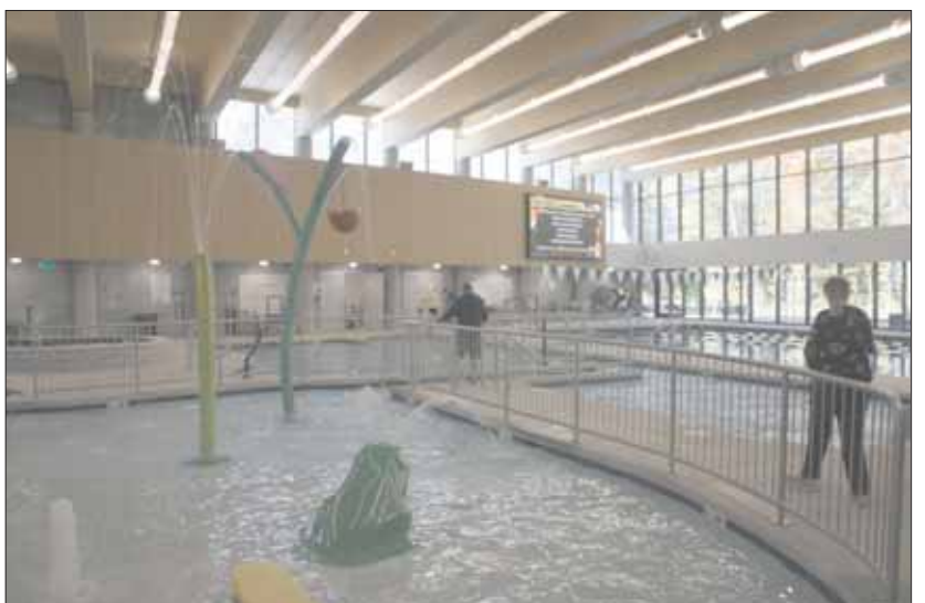
The pool area is sure to be a big hit with the public, especially in winter!