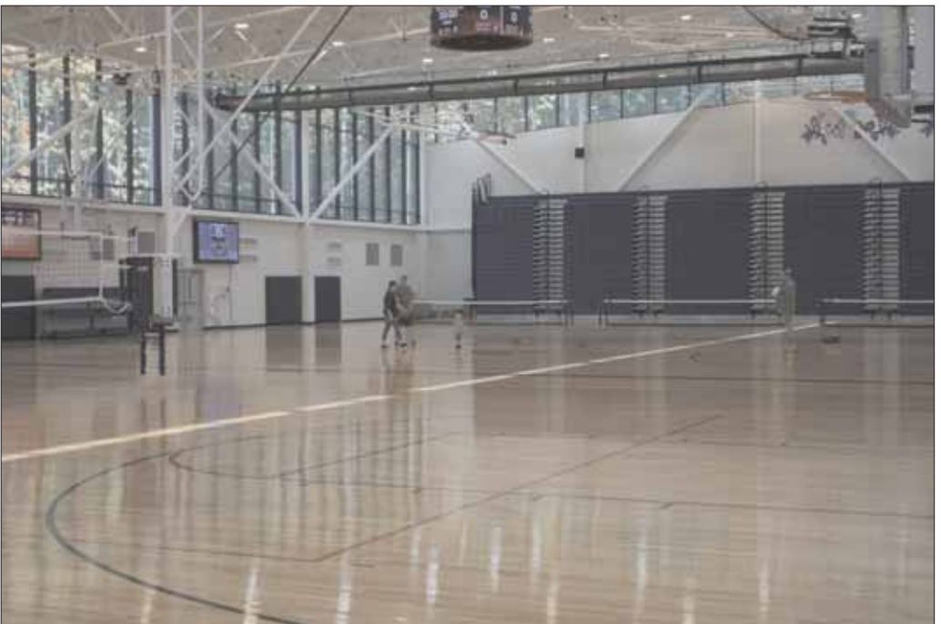
There are three basketball courts side by side.

For more information about the Potawatomi Community Center or to sign up for a membership, please go to community.fcpotawatomi.com.