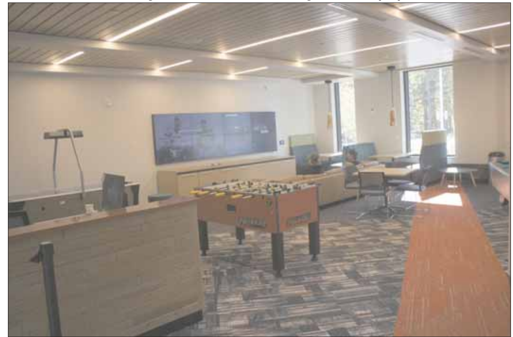
No community center would be complete without a game room.