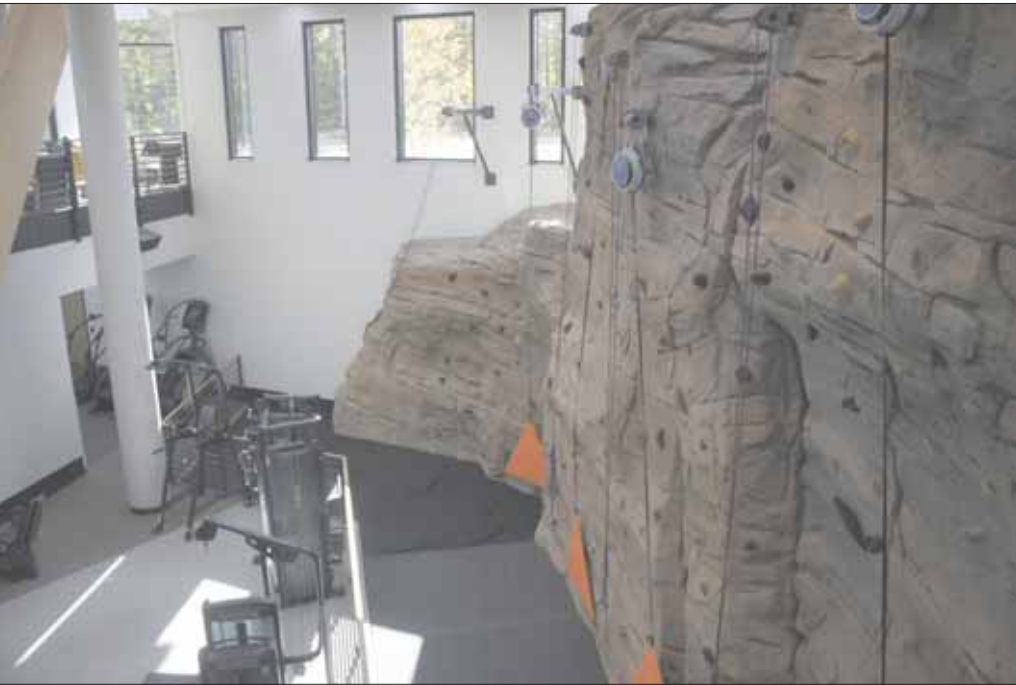
There is a rock wall climb in the weight room, only part of which is seen in this photo.