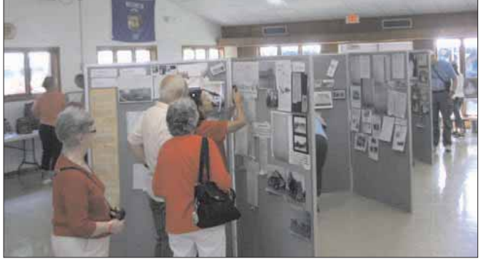
The historical display took everybody back to the earliest days of Armstrong Creek, and drew a crowd.