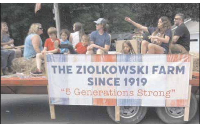
The Ziolkowski float won a first prize!

It is probably too soon to begin work on the bicentennial celebration, but lets hope all of our communities in the area are still here, healthy and happy when that time comes. You can bet that the people who handle that event will be looking back on the success of the centennial committee back in 2022!