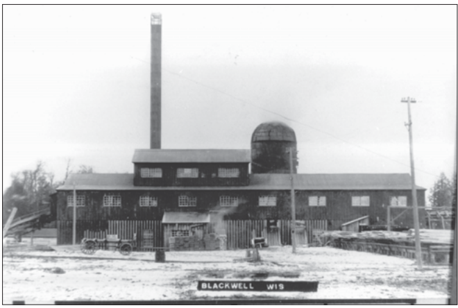
The Flanner Lumber Co. sawmill, the reason that there is a Blackwell

This Saturday, July 9th, Blackwell will be putting on a party to celebrate 100 years of being Blackwell. The event starts at noon, with something for everybody.