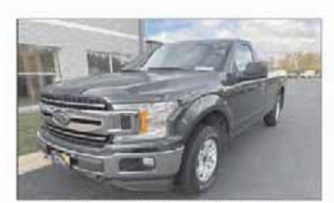
2018 Ford F-150 XLT 4WD 65,139 Miles - $31,495

2530 Neva Road • Antigo • langladeford.com • (715)627-2200 • 1800-232-5375