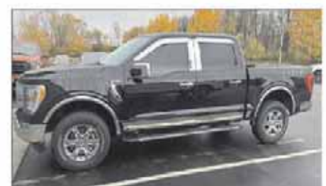
2021 Ford F-150 XLT 4WD 37,684 Miles - $43,995