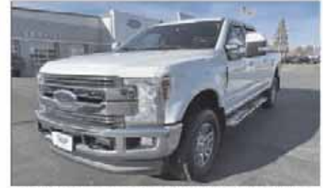
2019 Ford F-250SD Lariat 4WD 67,623 Miles - $58,995