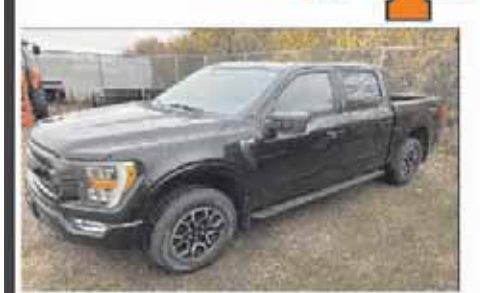
2021 Ford F-150 XLT 4WD 37,684 Miles - $43,995