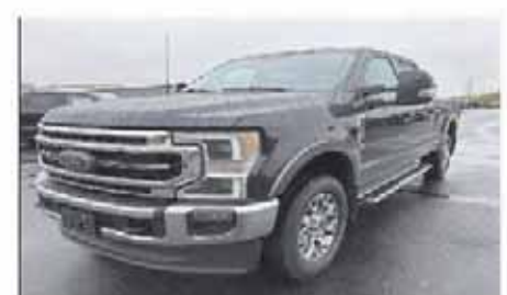
2022 Ford F-350SD Lariat 4WD 35,615 Miles - $75,995