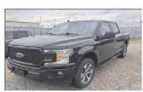
2020 Ford F-150 XL 4WD 36,731 Miles - $36,995