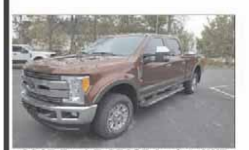
2017 Ford F-350$D Lariat 4WD 131,062 Miles - $47,995