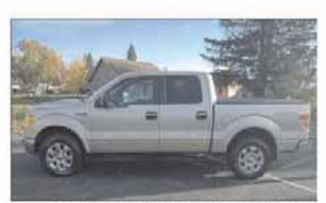
2013 Ford F-150 XLT 4WD 81,485 Miles - $20,495