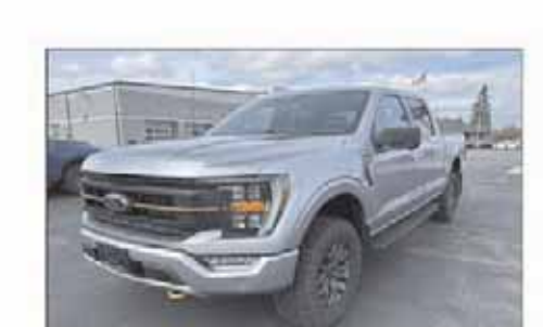
2022 Ford F-150 Tremor 4WD 30,188 Miles - $57,995