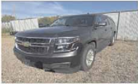
2018 Chevrolet Suburban LT 4WD 94,636 Miles - $33,995