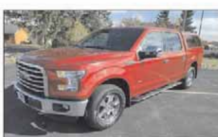
2015 Ford F-150 XLT 4WD 191,992 Miles - $18,995