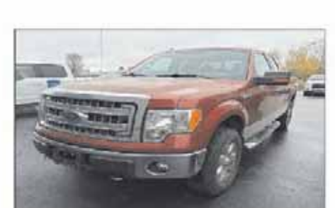
2013 Ford F-150 XLT 4WD 69,888 Miles - $21,995