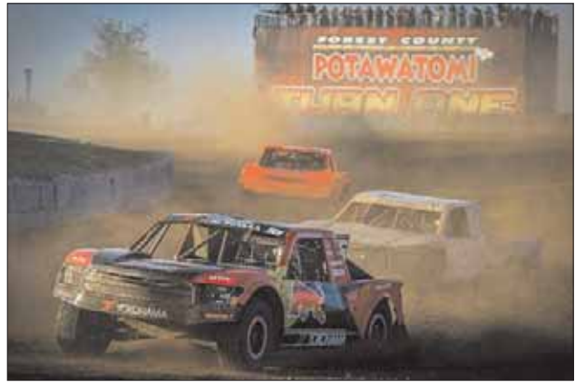
On September 1, 2024 Pro category racers will compete in the 9th annual Red Bull Crandon World Cup Sunday. The richest single day in off-road racing includes the powerful unlimited four-wheel drive trucks like the Red Bull/Yokohama Pro 4 of Andrew Carlson.

For 55 years, Crandon International Raceway has been a powerful force in keeping off-road motorsports alive and well for racers and fans alike. Today the iconic Wisconsin facility's ownership group announced that it will celebrate more than five decades of racing excellence with a record season purse of more than $300,000.